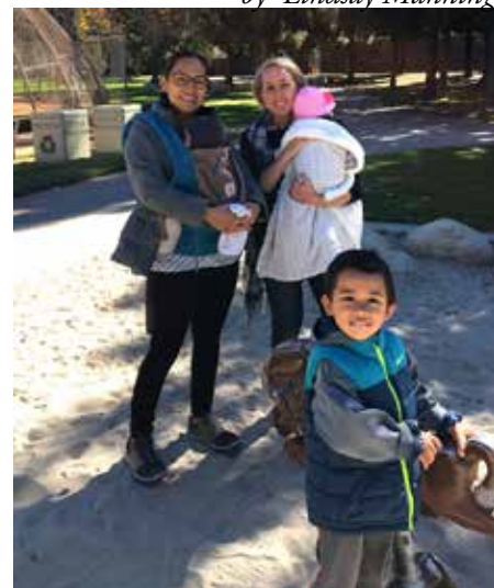
Moms at a recent play date at Morrison Park

The group provides a great way to meet other families in the neighborhood, as well as share in "mom" questions, tips, advice, recipes, organizing play dates, babysitting and any other topic that might frequent a group of mothers! Plus, it is always nice to be able to see familiar faces when out on walks and bike rides throughout our lovely Square. The group is fairly new so we welcome any other moms in the neighborhood. We have a Facebook page titled "Washington Square Mommies" which has been a great way to organize meet ups, communicate, ask questions, etc. We'd love to have you join us so feel free to put in a request to be added to the group – we would love to meet you!